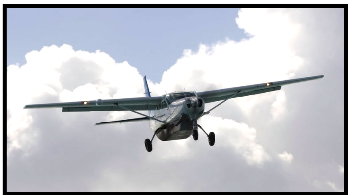
Cessna C-208B Caravan beats weather on final-approach

The IOMAX firm in Mooresville recently upfitted and delivered a Cessna C-208B Grand Caravan aircraft to the Royal Jordanian Air Force (RJAF). The new aircraft had Intelligence, Surveillance and Reconnaissance capabilities added to it; this included electro-optic/infrared and radar systems. There will be a total of four such upgraded aircraft delivered, adding to the six "Caravans" that the RJAF already flies. The upgrade is part of a more encompassing DoD program to supply allied forces with right-sized aircraft for border security and tactical missions. Brigadier General Mohammad Hiyasat—Commander of the Royal Jordanian Air Force—was present at Lake Norman Airpark to receive the newly upgraded aircraft, as was Senator Ted Budd. The C-208B is a legendary single turboprop aircraft, with a 30-year history of reliable flying throughout the world. It has a high payload capacity, with low operating and maintenance costs. It's capable of many mission types, often operating in very austere environments. IOMAX also produces the "Archangel" aircraft that is highly capable of operating in hostile settings.