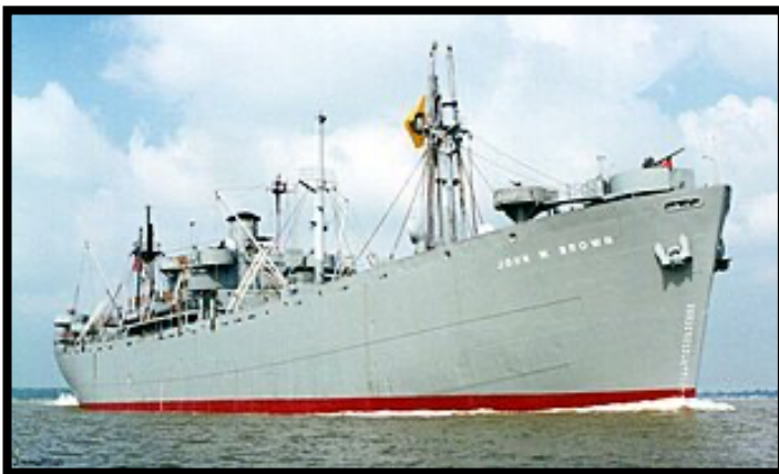
SS John W. Brown sailing the Great Lakes in 2000

Liberty Ships were the workhorses afloat during WWII. Initially, President Roosevelt dubbed them "Ugly Ducklings," but he soon saw their great utility as they transported material and troops to overseas battlefields. Early in the war, 225 ships were converted to troop transports, but after the Allied Victory in North Africa, those ships were used to transport enemy POWs to the U.S. The average build time of a liberty ship was 39 days; however, one was built in just 4 days and 15 hours. They were built in 18 shipyards on America's coasts. Rosey the Riveter built the ships as fathers, husbands, sons, and brothers went "over there" to fight the war. However, they welded rather than riveted hull seams of these ships. 2,400 ships were still seaworthy at the end of the war. The surplus ships were mostly bought up by Greek and Italian shipping magnates who built their empires on the backs of the Liberty Ships. Only four remain today: three are floating museums and one is headquarters for a seafood company. Also, wooden hatch covers salvaged from the old Liberty Ships proudly live on as coffee tables, featuring a nautical/military theme.