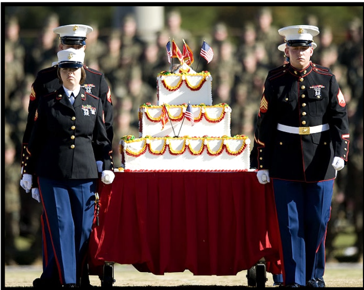
Past USMC birthday ceremony on Camp Lejeune

FEDVIP Open Season Nov 13 – Dec 11, 2023