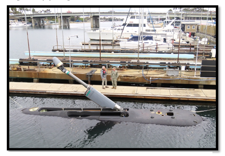
Navy "Orca XL" submarine drone during acceptance

The U.S. Navy has received the first of six "Orca XL" submarine drones. They're Orca Extra Large Uncrewed Undersea Vehicle (Orca XLUUV). Over a decade of Boeing research went into bringing this submarine drone into existence. It's long-range, uncrewed, and can operate independently of its host vehicle. The Orca underwent successful in-water and underwater testing for about a year before being turned over to the Navy. The Orca is huge, and its shape is somewhat similar to a classic torpedo, but that's where the similarity ends. An Orca weights 50 tons out of water, it's 51 feet long, and 8.5 feet tall. Unofficial sources indicate that this uncrewed diesel-electric sub has a range of 6,500 nautical miles and can dive to 11,000 feet. The sub has a modular payload bay where different "packages" are swapped out for each type of mission. Those could include underwater mining, electronic warfare, Intelligence gathering, etc. This drone submarine is yet another indication of how all U.S. military branches are increasingly opting for uncrewed weapon platforms to replace crewed aircraft, land vehicles, surface ships, and underwater vessels.